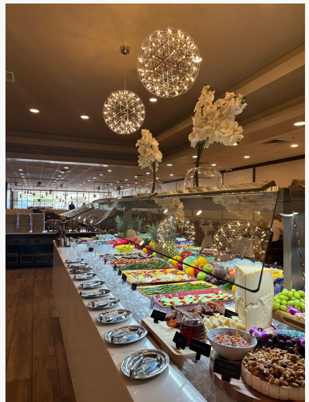
Deerfield's Gourmet Table

Nestled in the heart of Deerfield Beach's Hillsboro Square, steps from the beach and a short 7-minute drive from Boca Raton, this expansive venue nearing 11,000 square feet, with capacity for close to 300 guests, blends the rustic elegance of Southern Brazilian gaucho culture with contemporary coastal sophistication. With its state-of-the-art private rooms, it stands as the top choice for unforgettable events in Deerfield Beach and neighboring communities. The soft