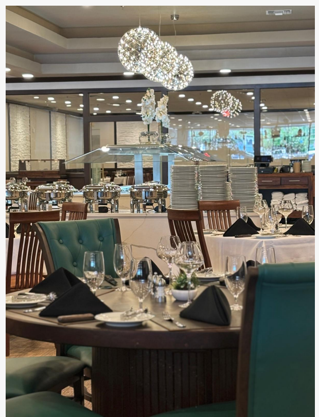
Adega Deerfield Beach Location

This press release can be viewed online at: https://www.einpresswire.com/article/803115753