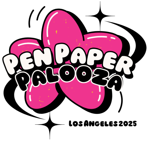
Pen Paper Palooza Logo

This press release can be viewed online at: https://www.einpresswire.com/article/803134838