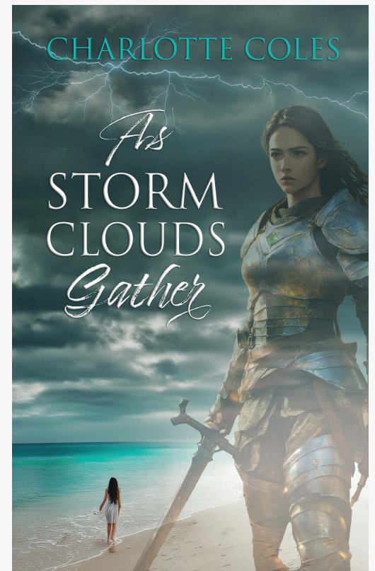
As Storm Clouds Gather by Charlotte Coles, designed by CED