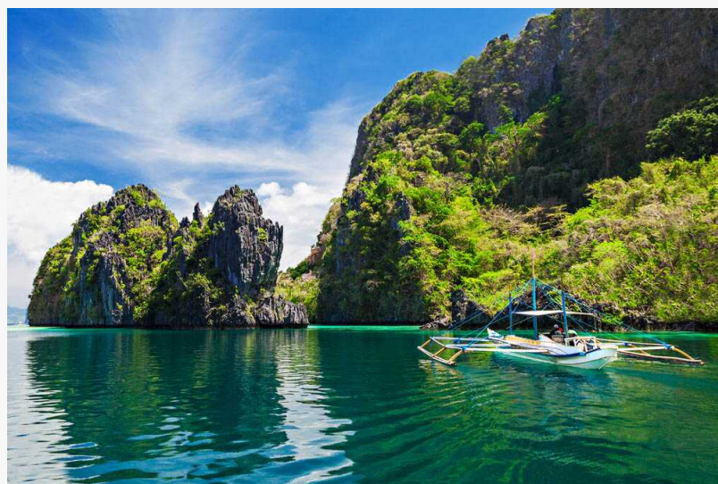
Philippines on the Water