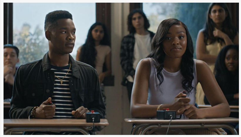
Behold a Lady