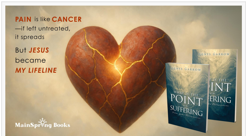
What Is The Point In Suffering From God's Perspective by Agnes Garrow