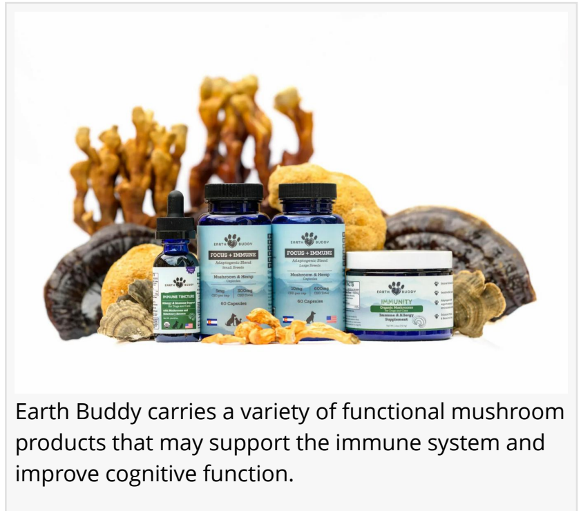
Earth Buddy carries a variety of functional mushroom products that may support the immune system and improve cognitive function.

“Our mission has always been to provide pet parents with real solutions—clean, honest products