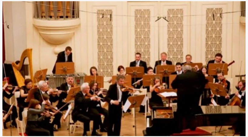
2025 Prokofiev International Music Competition Asia-Pacific Preliminary Round Begins, Promoting Musical Exchange in the Region