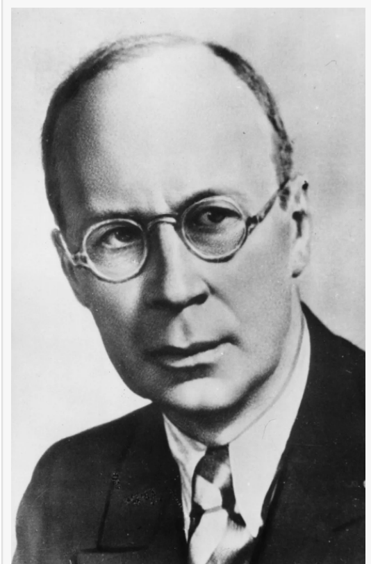
2025 Prokofiev International Music Competition Asia-Pacific Preliminary Round Begins, Promoting Musical Exchange in the Region

Since its inception, the competition has attracted accomplished musicians from around the world and has become a notable international music event in Russia. Having successfully held multiple editions since 1991, the competition has established a respected reputation worldwide. The competition joined the World Federation of International Music Competitions in 1997 and became an international music competition endorsed by China's Ministry of Culture in 2012. To date, it has received recognition from more than 80 higher arts institutions globally and support from the cultural ministries of China and Russia. Due to its broad influence and professional standards, many musicians from around the world have gained recognition through this competition, which has both witnessed the growth of numerous talented musicians and contributed to the