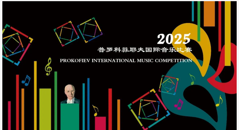
2025 Prokofiev International Music Competition Asia-Pacific Preliminary Round Begins, Promoting Musical Exchange in the Region