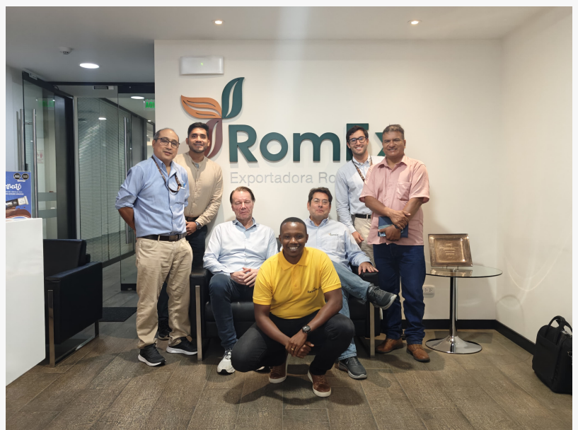
The Farmforce and Romex teams meet in Lima to strengthen their partnership and advance traceability efforts in Peru's cocoa and coffee supply chains.

Romex has been leveraging Farmforce's platform to manage farmer and field data, conduct mapping, and provide EUDR-compliant traceability to international clients such as General Cocoa/Sucden, Hershey's, and Nestlé. This work is central to Romex's responsible sourcing program and long-term sustainability commitments.