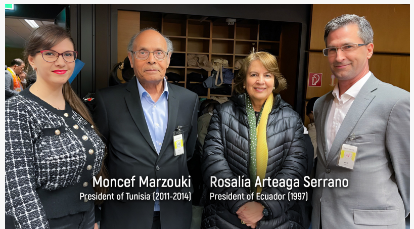
Rosalía Arteaga Serrano, President of Ecuador (1997) Moncef Marzouki, President of Tunisia (2011-2014) with ALLATRA volunteers