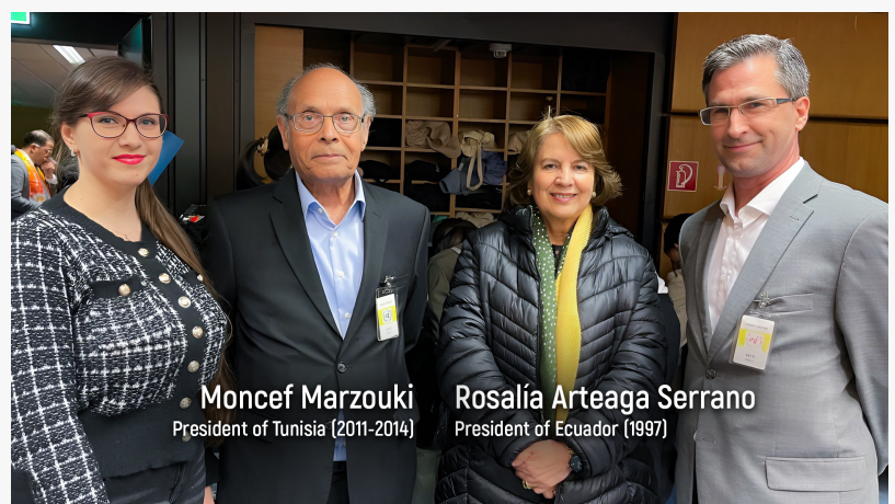
Rosalía Arteaga Serrano, President of Ecuador (1997), Moncef Marzouki, President of Tunisia (2011-2014) with ALLATRA volunteers

About the ALLATRA International Public Movement