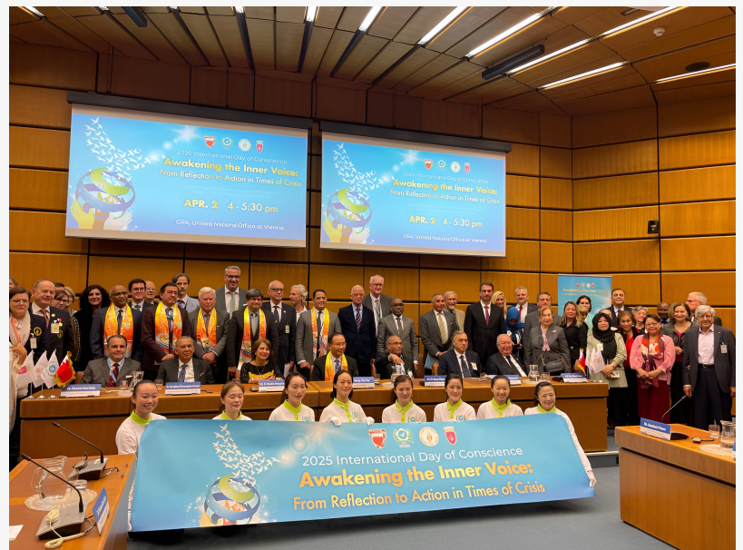
ALLATRA Movement Representatives at the International Day of Conscience with world leaders at the UN Headquarters in Vienna