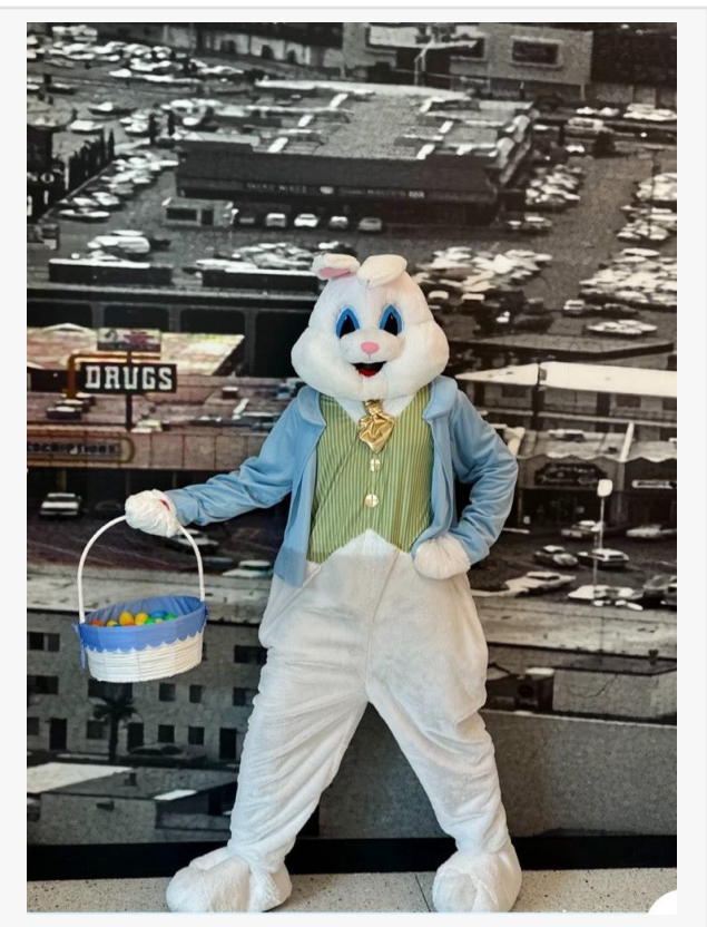
Easter Bunny at Bagelmania