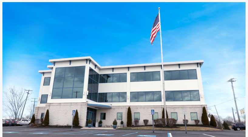
Brockley Dental Center