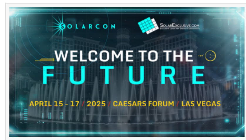
SolarCon 2025 Launches in Las Vegas, Bringing Together the Nation's Top Solar Innovators and Industry Leaders from April 15–17 at Caesars Forum

Attendants can expect a packed schedule with addresses, hands-on technical sessions, and the aforementioned panel discussions, all of them sharing the latest developments shaping solar's future. Attendees will gain practical knowledge on cutting-edge technologies, sales strategies, and methods for expanding solar enterprises in a dynamic market. Focusing almost entirely on crossindustry partnerships, SolarCon is one of the best opportunities for interested