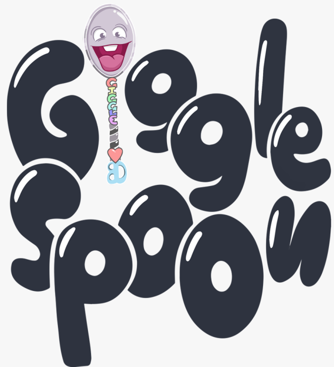
Giggle Spoon - Books + Music - Serving Up Laughter