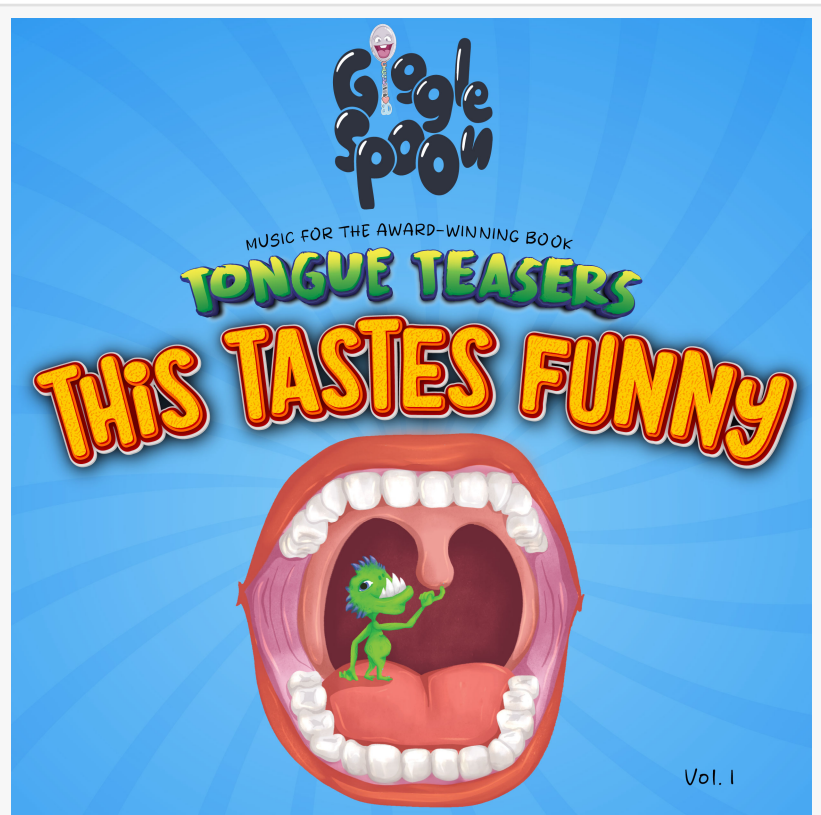
New Music Album from Giggle Spoon THIS TASTES FUNNY

The book is currently on an international tour, having just been at the book fairs in London, England and Bologna, Italy. Its next stop will be April 26-27 at the United States' largest literary event, the LA Times Festival of Books , a free-to-the-public event held on campus at University of Southern California, where the creators of the book and music will both be available for meet-and-greets, book signings, photos, and interviews with the press.