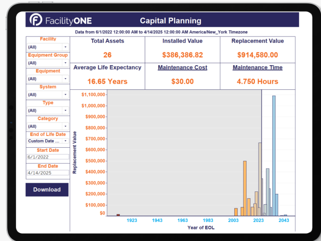
FacilityONE Capital Planning Dashboard