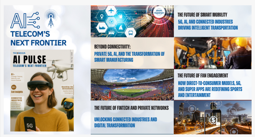
Connected Industries (Private Networks) Insights for Al Pulse: Telecom's Next Frontier Magazine | TeckNexus