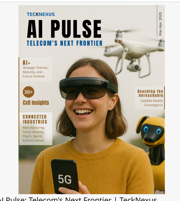
Al Pulse: Telecom's Next Frontier | TeckNexus Magazine