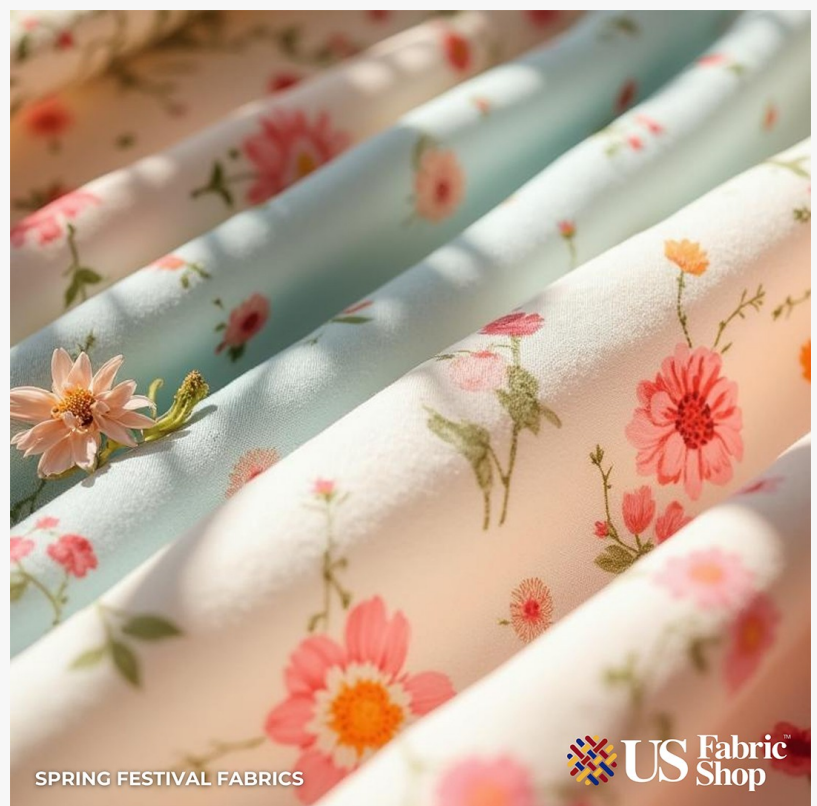
Spring Festival Fabricss

FUQUAY-VARINA, NC, UNITED STATES, April 16, 2025 /EINPresswire.com/ -- US Fabric Shop is excited to introduce its expanded Spring Festival Fabrics collection. Designed for quilters, sewists, and craft lovers, this collection offers fresh, seasonal designs perfect for adding charm to any project. With floral fabrics, exclusive Tula Pink designs, and top-quality materials, US Fabric Shop continues to bring some of the best fabric options to customers across the United States.