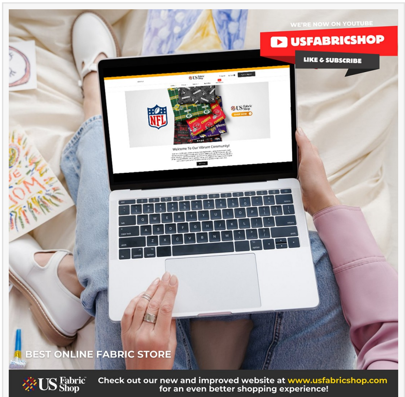
Best Online Fabric Store

US Fabric Shop has quickly become known as one of the best fabric online stores in the US . Its reputation for offering high-quality fabrics, including exclusive collections like Tula Pink and a wide range of floral patterns, has made it a go-to destination for crafters and designers. With a user-friendly website, detailed product descriptions, and exceptional customer service, US Fabric Shop ensures that customers have an easy and pleasant shopping