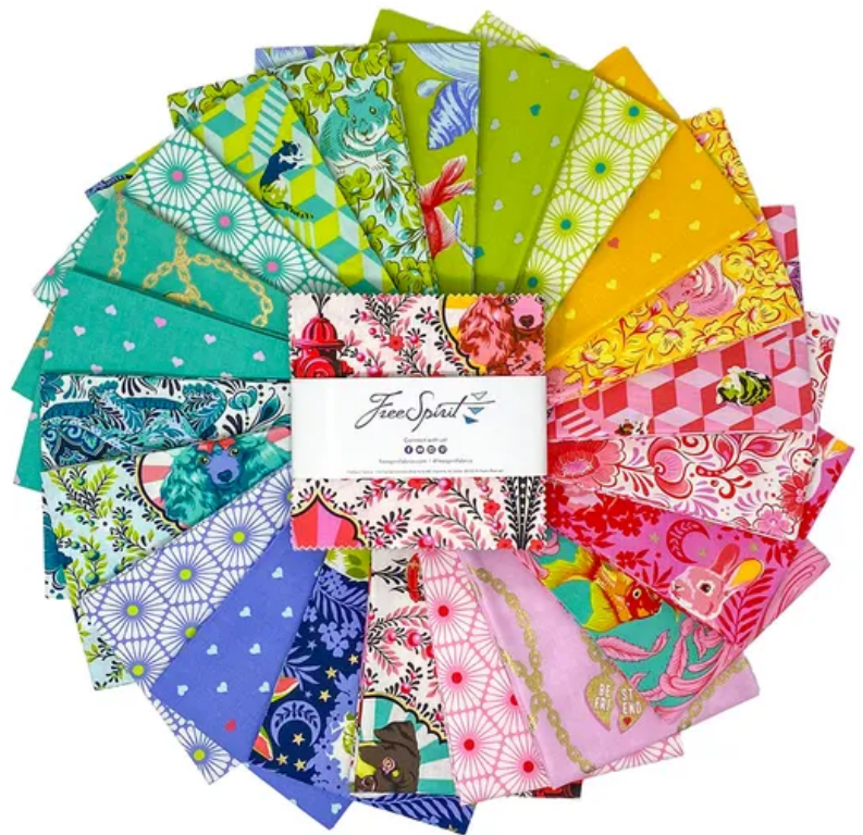
Tula Pink fabric