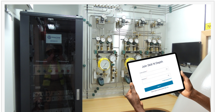
Unique Group Diver Control and Skill N Depth Platform

For technical details regarding the Diver Control Center and related integration capabilities, please reach out to Unique Group's Diving & Life Support specialists at www.uniquegroup.com .