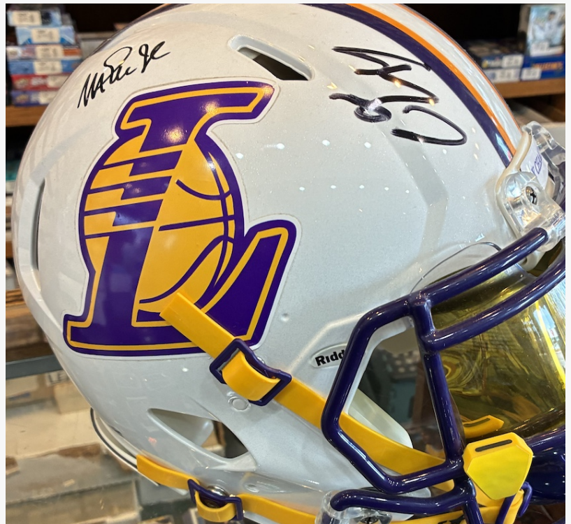
Magic & Shaq Los Angeles Lakers Autographed One of a Kind Helmet Offered To Support Travelingwiki Free Special Needs Resources