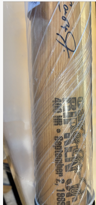
Exclusive 400th Home Run Commemorative Cal Ripken Jr. Autographed Bat Offered by TravelingWiki Foundation To Support Special Needs Non Profit Work