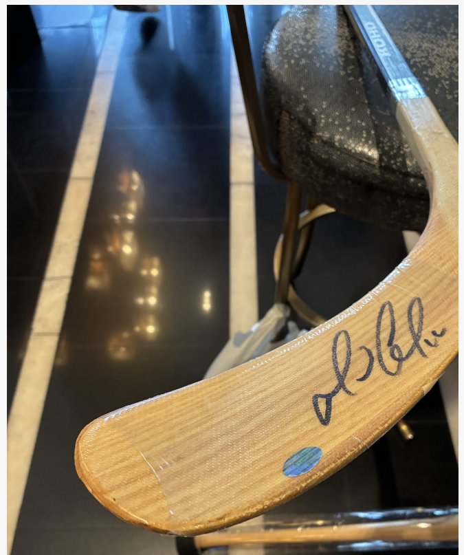
Exclusive Mark Messier Autographed Hockey Stick Offered by TravelingWiki Foundation To Support Special Needs Non Profit Work

This recent work arises as Microsoft Bing's search engine recognized TravelingWiki Foundation's “Rapid Growth and Increasing Influence in Travel & Accessibility.” Just a few hours prior, Microsoft hailed TravelingWiki as one of the