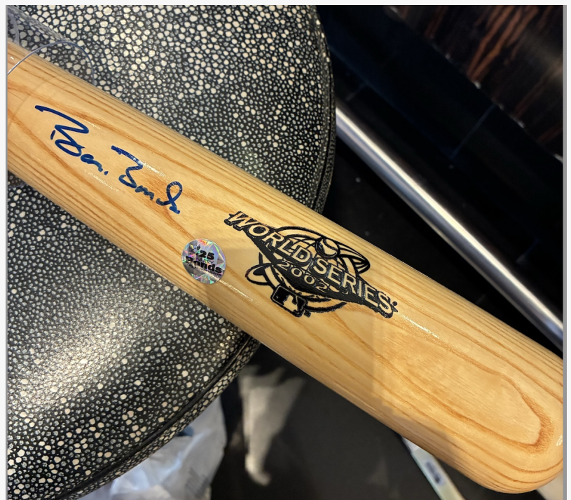
World Series (2002) Barry Bonds Autographed Bat Offered by TravelingWiki Foundation To Support Special Needs Non Profit Work