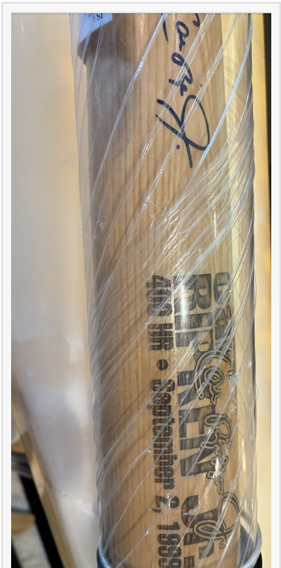
Exclusive 400th Home Run Commemorative Cal Ripken Jr. Autographed Bat Offered by TravelingWiki Foundation To Support Special Needs Non Profit Work