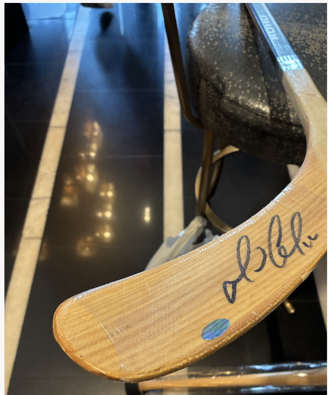
Exclusive Mark Messier Autographed Hockey Stick Offered by TravelingWiki Foundation To Support Special Needs Non Profit Work