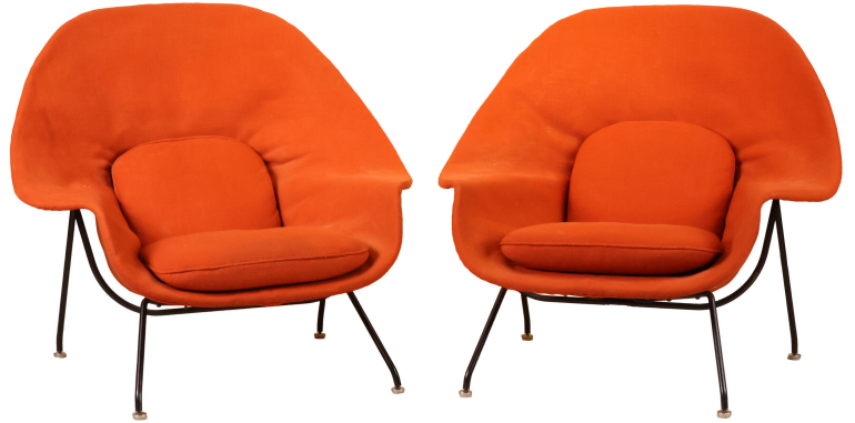
Pair of Eero Saarinen for Knoll "Womb" chairs, in orange upholstery.

Anyone looking for additional images, condition reports or info about an object is invited to visit the Nye & Company website or send an email to info@nyeandcompany.com . For those who would like to inspect the items in person, a public exhibition and preview will be held April 21-25 and April 28-30, from 10am to 4pm Eastern time.