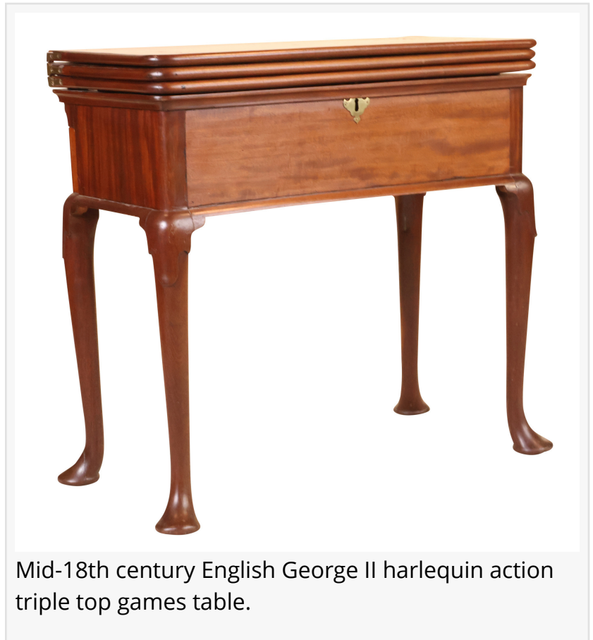
Mid-18th century English George II harlequin action triple top games table.