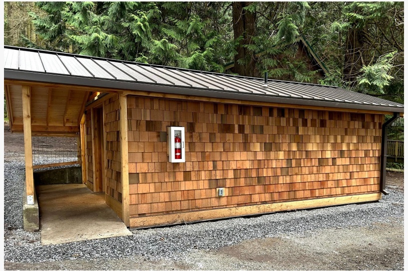
Camp Orkila New Restroom Facilities by Chad Fisher Construcion

EASTSOUND, WA, UNITED STATES, April 16, 2025 /EINPresswire.com/ -- Chad Fisher Construction (CFC) is proud to announce the successful completion of the Cascade Restroom renovation project at Camp Orkila , located on scenic Orcas Island in Eastsound, Washington. The two-month project involved a full-scale renovation of an aging restroom and shower facility to better serve the campers, staff, and visitors who rely on the space each season.