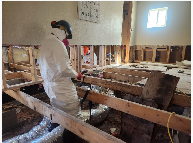
Members repairing a home impacted by the flood.

AUSTIN, TX, UNITED STATES, April 17, 2025 /EINPresswire.com/ -- American YouthWorks (AYW) annually connects over 400 youth and young adults, ages 16-35, with innovative education, paid career training, certification attainment, and comprehensive job readiness services. Through two award-winning programs , Conservation Corps (AYW-CC) and YouthBuild (AYW-YB), participants gain valuable job skills