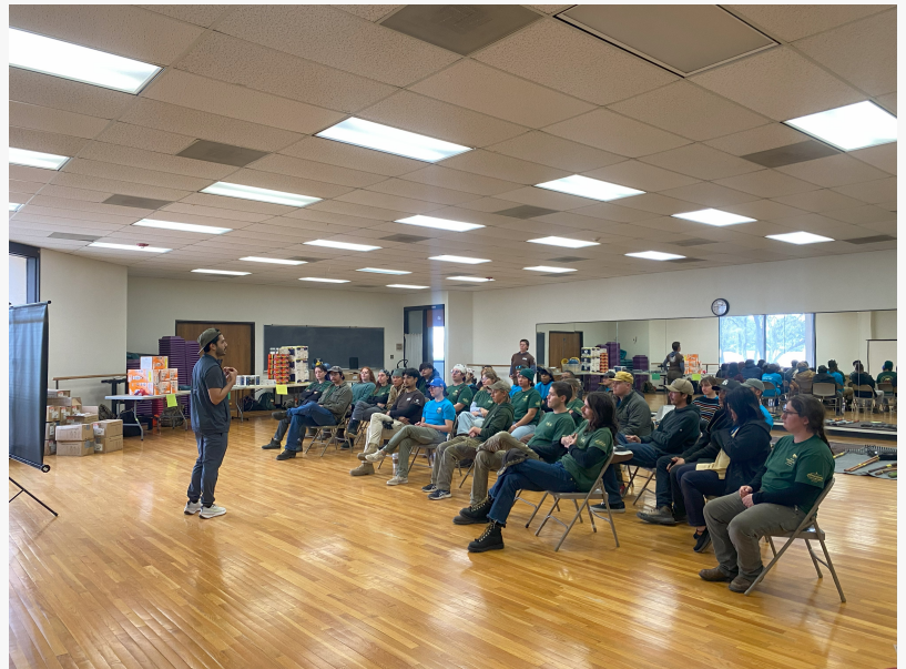
Members in a classroom setting, training in disaster response.