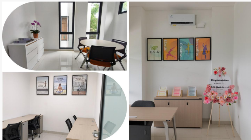
ECI Elastic Jakarta Facilities