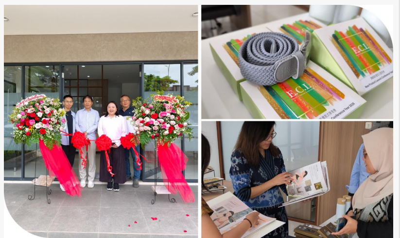
ECI Elastic Team at Opening of Jakarta Plant

JAKARTA, INDONESIA, April 17, 2025 /EINPresswire.com/ -- ECI Elastic Co., Ltd. , a global innovator in sustainable elastic textile solutions, has announced the opening of its new office in Indonesia, coinciding with the introduction of its 2025 New Product Collection. This expansion highlights ECI's strategic commitment to Southeast Asia's growing textile sector and its continued investment in environmentally responsible manufacturing.