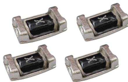
Weldable Ultra-Rugged Metal Tag for Equipment