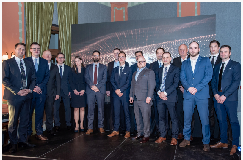
Klasszis 2025 - nominees for the awards Portfolio Manager of the Year and Emerging Portfolio Manager of the Year

The role of investment funds in Hungarian savings is becoming increasingly important; according to Bamosz data, their capital has continued to grow over recent years and decades, despite new crises and market turbulences. According to MNB statistics, a large portion of this vast wealth is typically held by households. This enormous amount of capital gives the sector significant macroeconomic importance and highlights the need for professional evaluation and recognition of funds and their managers. Privátbankár.hu has presented these awards for the twelfth consecutive year, this time at a ceremonial event on April 15.