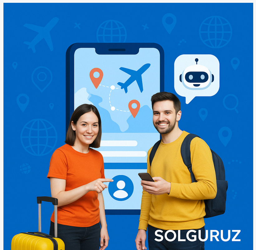
AI Trip Planner App