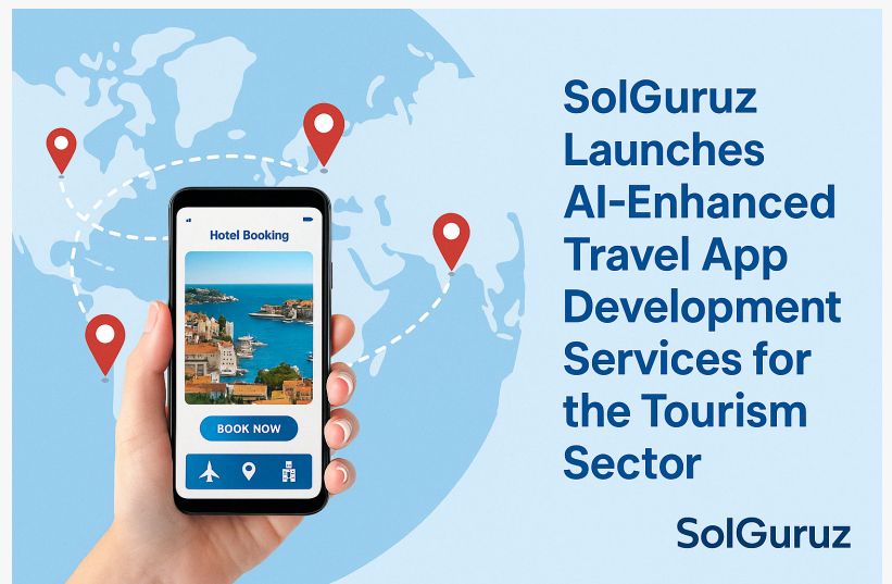
SolGuruz Launches AI-Enhanced Travel App Development Services for the Tourism Sector

"We're helping tourism businesses close that gap with technology that responds faster and learns from how users behave."