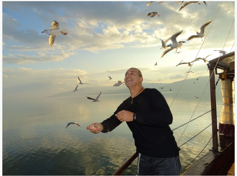
Sea of Galilee

Hidden within the bustling labyrinth of Jerusalem's Old City lies the Church of the Holy Sepulchre—arguably the most important church for Christians. It was built in 325/326, is located