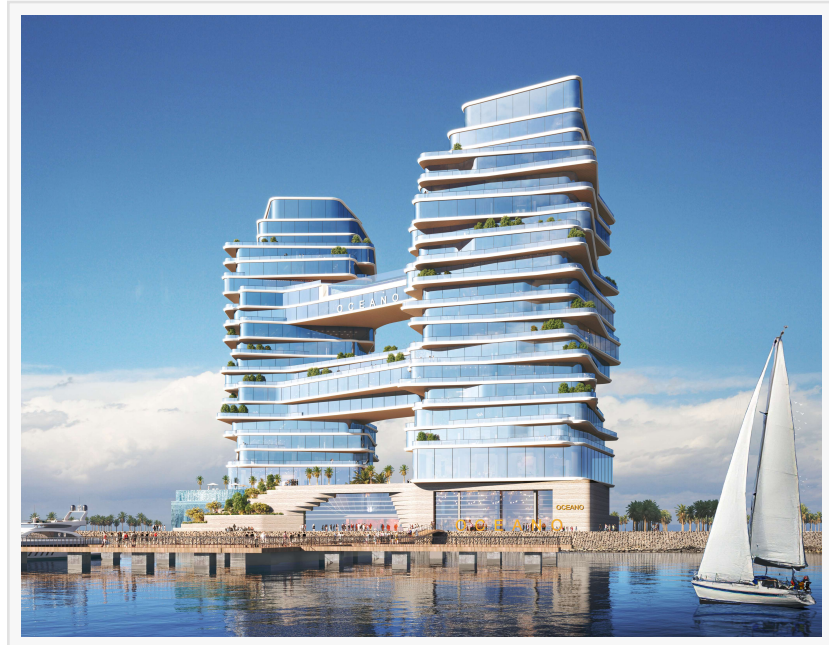
Oceano located on Al Marjan Island, Ras Al Khaimah by Dewan Architects + Engineers

Now, to mark 40 years of design excellence, Dewan unveils Dewan – An Architecture Monograph, a beautifully curated 160-page hardback publication. The book traces the firm's journey, offering readers insight into its rich history, design philosophy, and bold vision for the future. Compiled through in-depth interviews with directors, thought leaders, and industry experts, it captures the essence of Dewan's impact on the built environment.