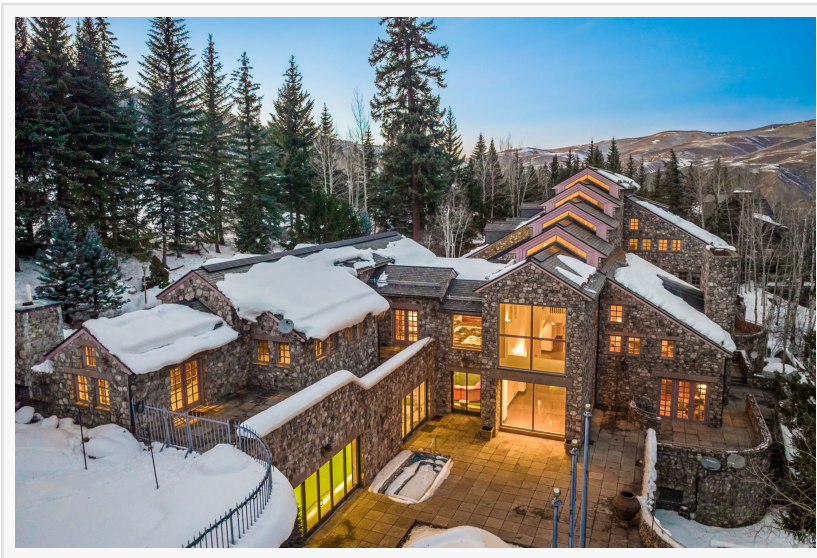
Designed by renowned architect Charles Sink

About Concierge Auctions Concierge Auctions is the world's largest luxury real estate auction marketplace, with a state-of-the-art digital marketing, property preview,