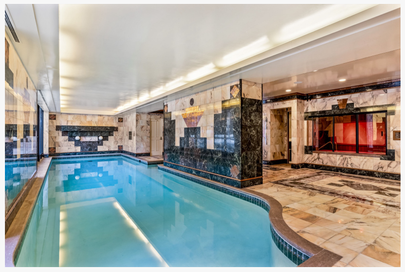
Grand entertaining spaces, wine salon, indoor pool, spa, and sauna