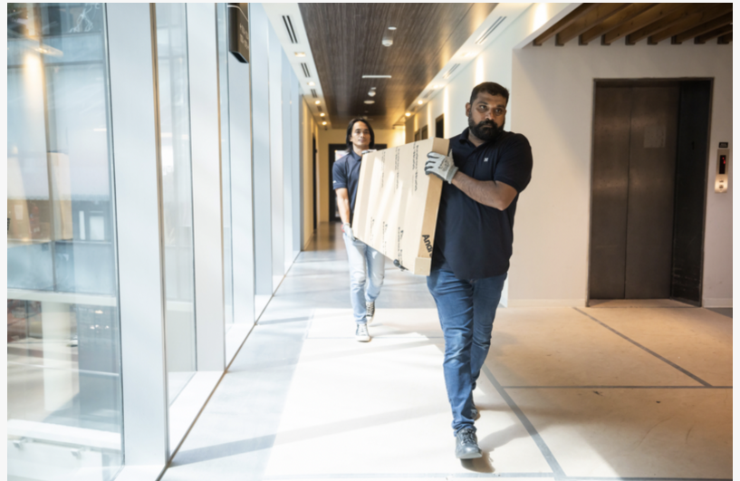
Mart® installation team

This press release can be viewed online at: https://www.einpresswire.com/article/804254427