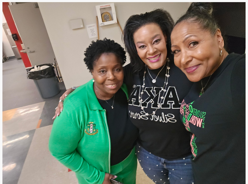
Members of Delta Epsilon Omega smile for the camera.

The feeling of being in control of their money