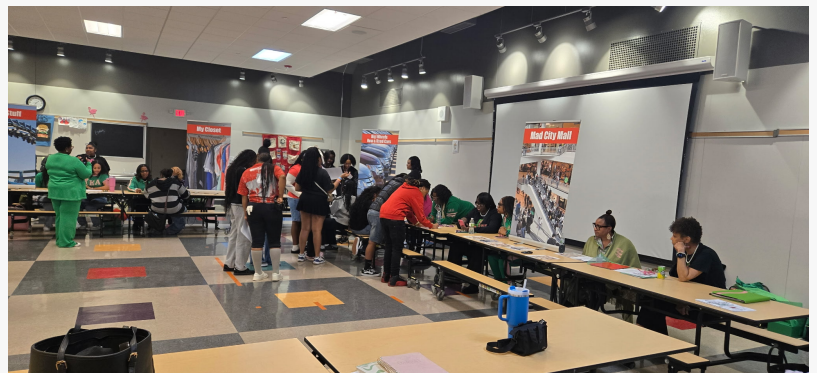
Participants actively involved in the simulation activities.