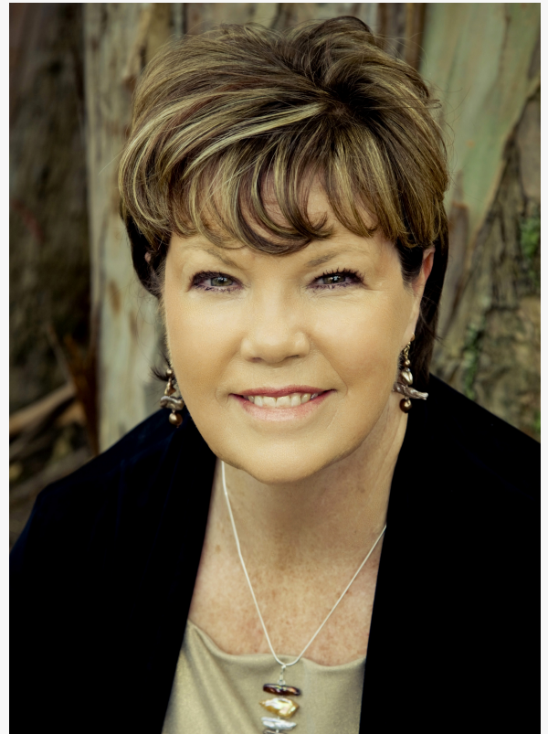
Poetry Journal to Inspire Women to Explore Their Emotions Through Poetry