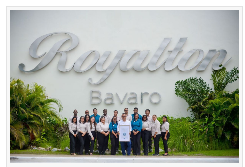
The Royalton Bavaro Team

Sustainability is deeply embedded in the resort's operations with a comprehensive Environmental Management Plan ensuring resource efficiency while protecting the region's cultural, economic and ecological balance. By implementing innovative strategies, the resort has successfully met Green Globe Sustainability