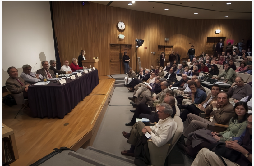
University of California Academic Senate Unveils Landmark Admission Policy Prioritizing Local Boarding High Schools

This press release can be viewed online at: https://www.einpresswire.com/article/804434513 EIN Presswire's priority is source transparency. We do not allow opaque clients, and our editors try to be careful about weeding out false and misleading content. As a user, if you see something