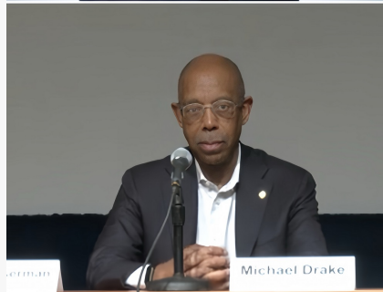
University of California Academic Senate Unveils Landmark Admission Policy Prioritizing Local Boarding High Schools