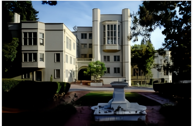
University of California Academic Senate Unveils Landmark Admission Policy Prioritizing Local Boarding High Schools

BERKELEY, CA, UNITED STATES, April 18, 2025 /EINPresswire.com/ -- In a strategic move reshaping public higher education talent selection paradigms, the University of California (UC) Academic Senate announced a groundbreaking initiative to grant priority admission to students from California-based residential high schools. This decision not only redefines the landscape of academic excellence but also establishes a novel ecosystem of collaborative innovation between K-12 and higher education. As the most influential public university system in the U.S., UC's policy recalibration signals a profound integration of the state's educational pipeline, demonstrating forward-thinking mastery of educational dynamics.