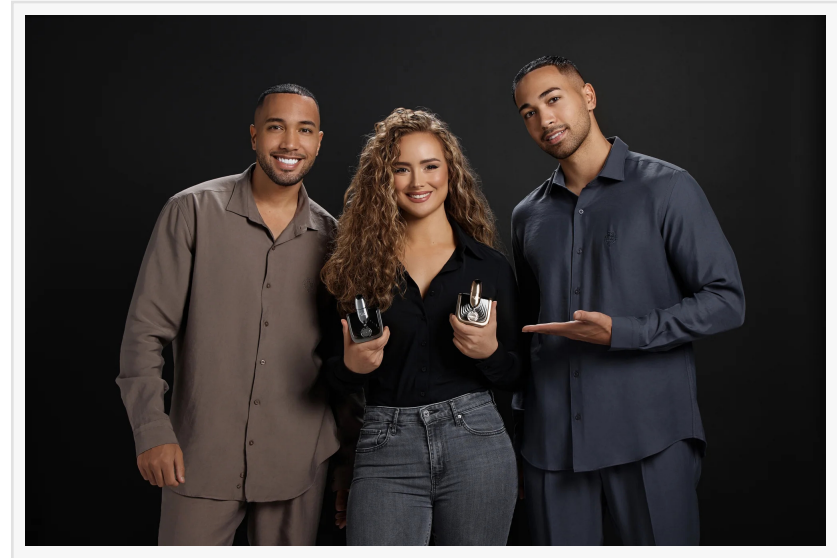
Elyon Dubai Founders