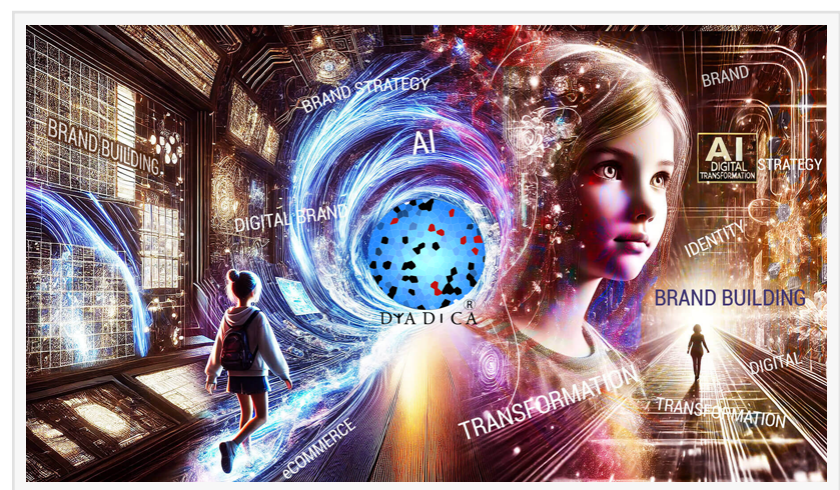
DYADICA & Co Global Consulting AI Artificial Intelligence

LONDON, GREATER LONDON, UNITED KINGDOM, April 18, 2025 /EINPresswire.com/ -- SXTC-DYADICA Global Brand Consulting, the global brand consulting division of DYADICA Brand Consulting, is proud to announce the official launch of its Brand Turn-key™ enterprise program—an all-in-one brand creation solution tailored for small businesses, startups, and fast-moving ventures.