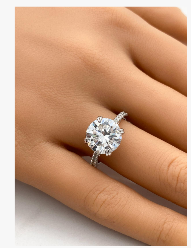
5-carat brilliant cut diamond set in 14k white gold. The center stone is of F color and Si2 clarity and is flanked by approximately 0.50 ctw diamonds. Estimate: $40,000-$50,000.