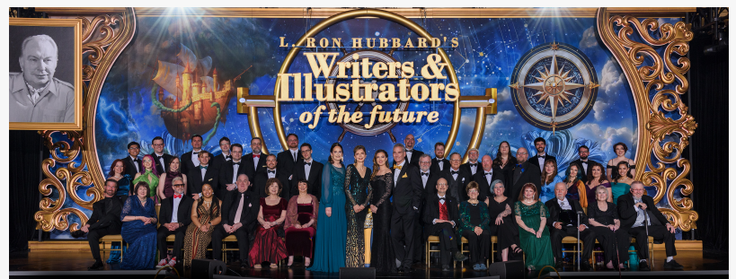
Winners and Judges at the 41st Annual Writers and Illustrators of the Future Awards Gala