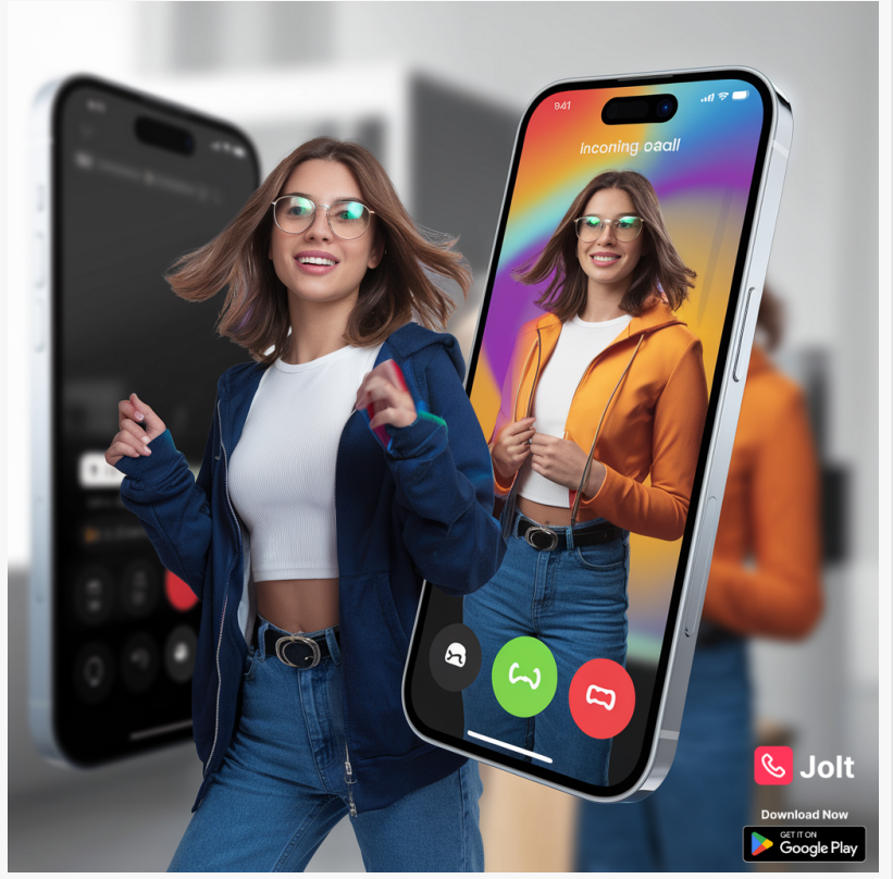
Best Customizable Phone App

Most default dialers provide limited customization. JOLT presents an