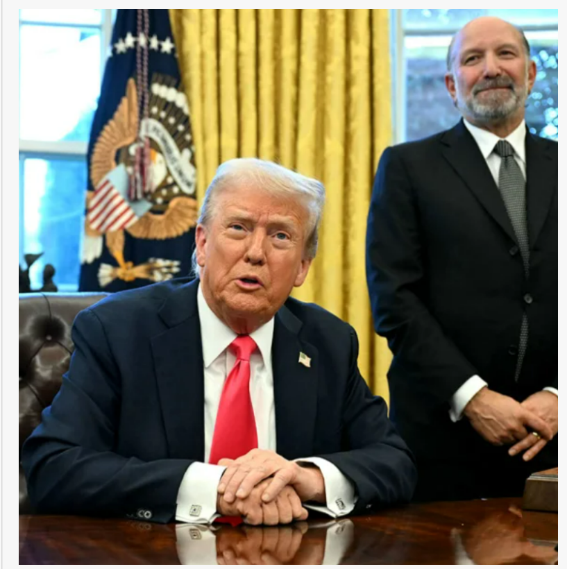
EB5 Green Card, EB5 Regional Center

Our team of seasoned attorneys provides comprehensive services for EB-5 applicants, including: