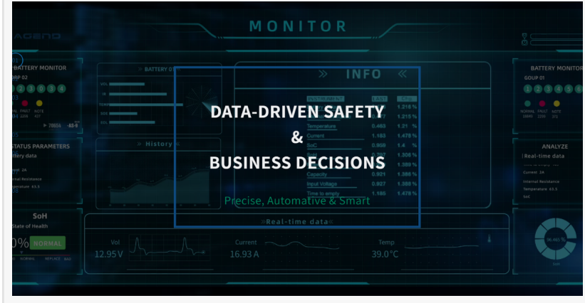
leagend data driven safety&business decision

Visualized Data: leagend UPS battery management solution offers an all-in-one computer and management