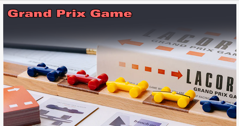
Grand Prix Game

Authentic F1 Strategy Meets Fun Gameplay