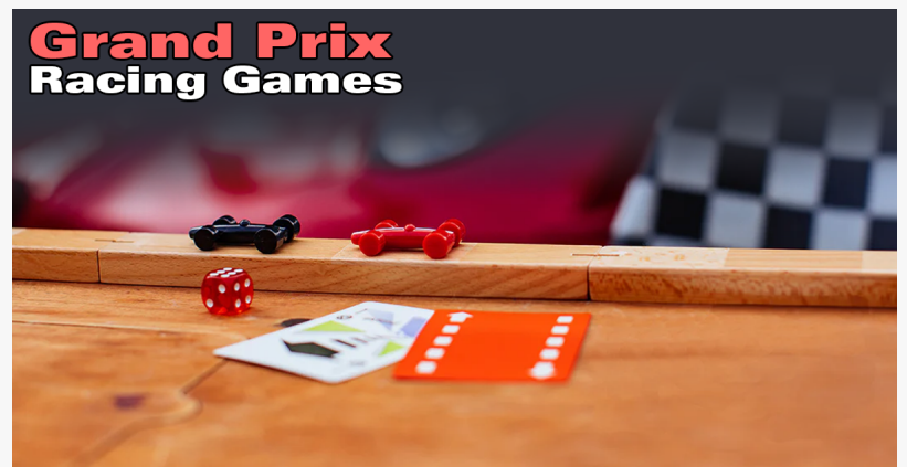
Grand Prix Racing Games