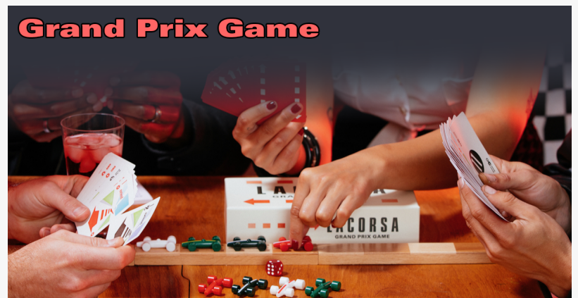
Lacorsa Grand Prix Board Game