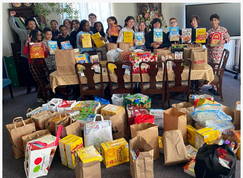
Middle School students from The Chapel School with donations of 413 boxes of cereal for Feeding Westchester

About Feeding Westchester: Feeding Westchester is a member of Feeding America, the nationwide network of more than 200 food banks serving every state in the United States. Our mission is to nourish our neighbors in the fight against hunger. We envision a community where all people have access to the food they need today, and the fundamental resources to build a better tomorrow. For more information, please visit www.feedingwestchester.org