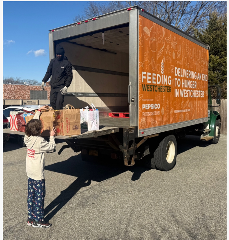
Student helping Load donations to Feeding Westchester!