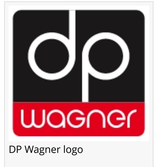
DP Wagner logo

This was the first year the Powder Springs-based company made the regional list since its acquisition by Traverse Group in 2023.