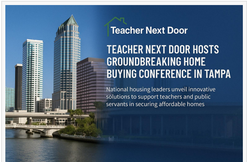
Teacher Next Door Grant and DPA Conference