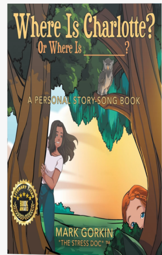
Where Is Charlotte? Or Where Is _____?: A Personal Story-Song Book