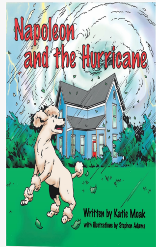
Napoleon and the Hurricane