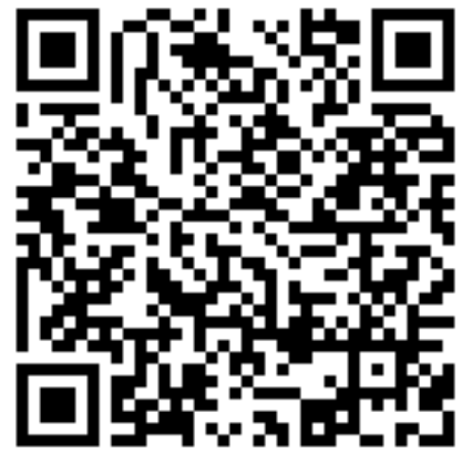
Donate QR Code