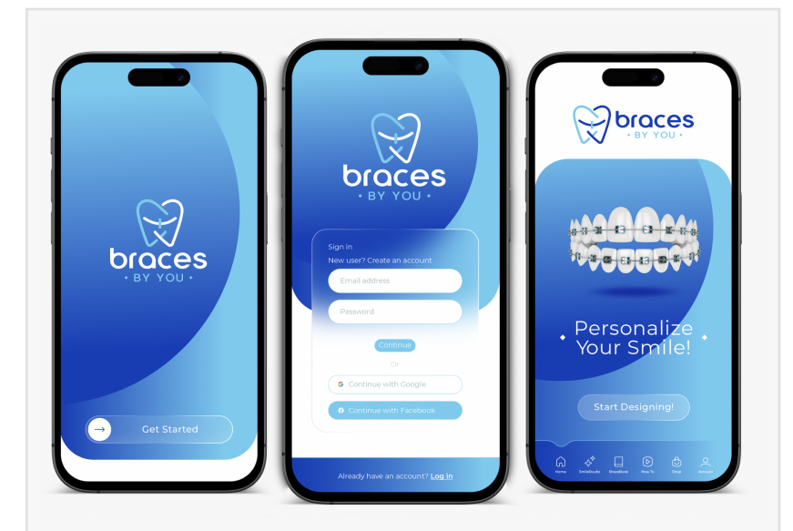
Braces By You, the Ortho app for your practice

Gretchen Brandenburg Wigal Orthodontics +1 740-263-1829 gretchenkbrandenburg@gmail.com