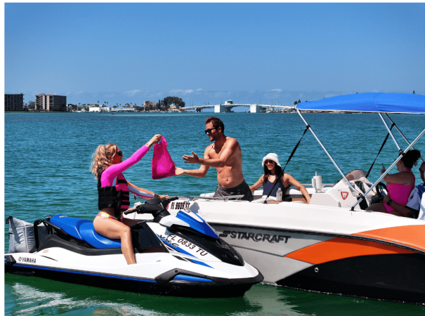
BoatBites Squad delivering hot food and cold drinks to a customer—on the water.